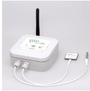
Sensor node type 2