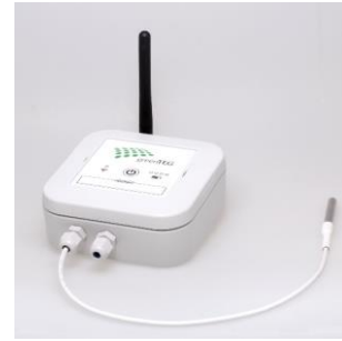
Sensor node type 3

1x combined humidity / ambient air temperature sensor